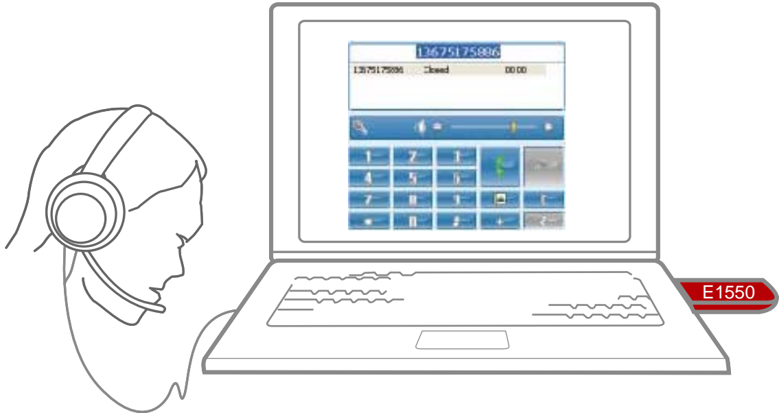
Figure 3-1 Voice service interface

Figure 3-1 shows the voice service interface.