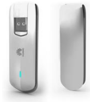
Figure 1-1 E3276s-150 profile