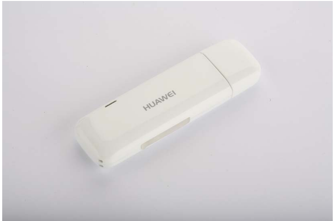
Figure 1-1 E156G profile